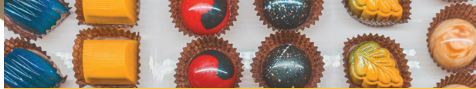
The event features chocolate from local chocolatiers

For over 50 years, SDYS has provided life-saving services for youth ages 0-25 who are experiencing homelessness, abuse and neglect. This special evening brings together compassionate advocates and leaders like you to help us continue building futures. We hope you will join us!